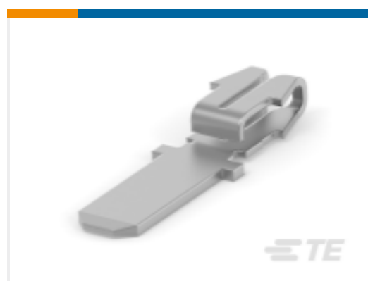
TE Part # 160897-2 MAG MATE WITH TAB