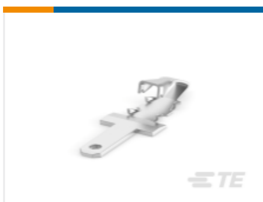
TE Part # 63161-2 MINI MAG-MATE 110F TAB 38-30TP PH BRZ