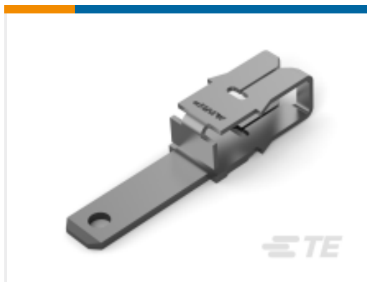
TE Part # 63777-1 MAG-MATE 187 F TAB 30-27 TPBR