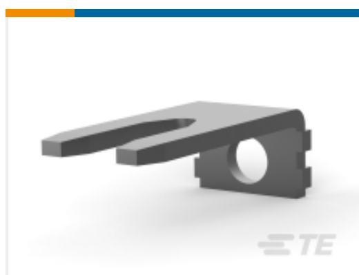
TE Part # 1987199-1 BRIDGE CONTACT