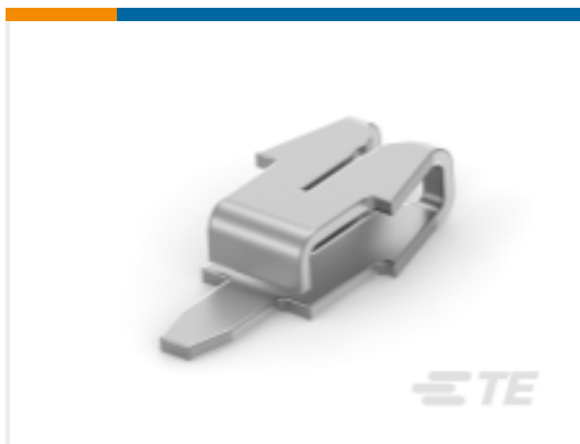
TE Part # 63818-1 TERM MAG-MATE POST 30-28TPCUBR