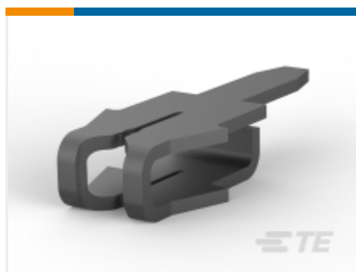
TE Part # 62430-1 MAG-MATE POST 28-30 013 TPBR