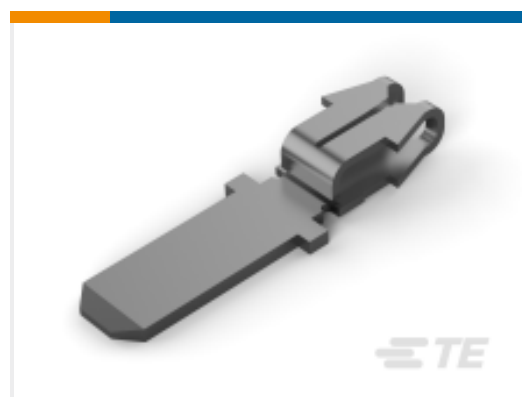
TE Part # 160809-2 MAG-MATE WITH TAB