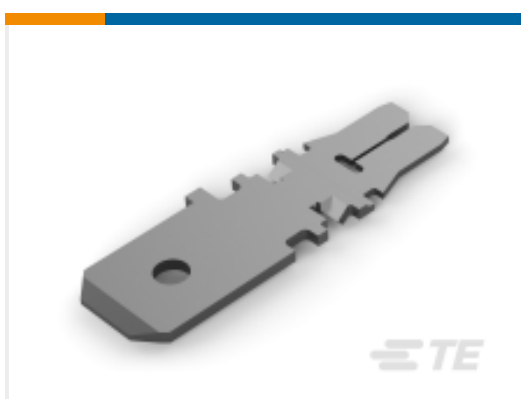
TE Part # 63711-2 TAB 187 MAG-MATE SLIM LN. PH BRZ