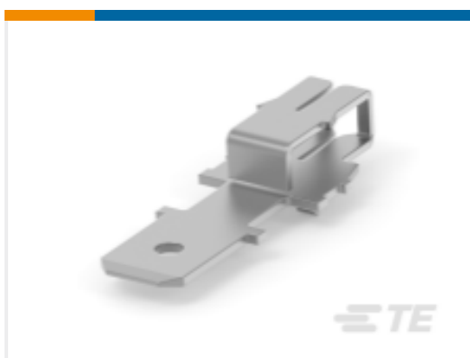
TE Part # 1217931-1 TAB,187 FASTON, MAG-MATE